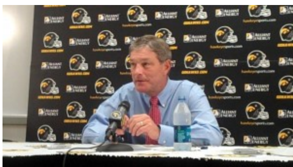
Iowa head coach Kirk Ferentz, Aug. 31, 2010

Below here are pictures of head coach Kirk Ferentz and select players on Tuesday from the Hayden Fry Football Complex. The No. 9 Iowa Hawkeyes play host to Eastern Illinois on Sept. 4 at 11 a.m. inside Kinnick Stadium.