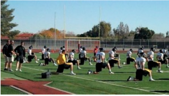
Players stretching during warm-ups at the start of Tuesday's practice.