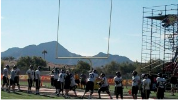
The offensive line takes part in a drill during Tuesday's practice.