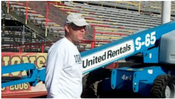
Iowa head coach Kirk Ferentz looks on as he takes to the practice field Tuesday.